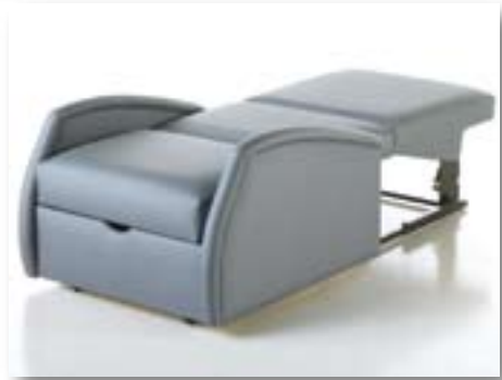
insets shown above