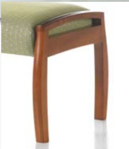
inset shown bench detail

INSPIRE bariatric benches are offered in two widths to meet a variety of seating needs. The upholstered bench seat is flanked by shaped wood ends with a stylish open detail that lends flexibility when positioning.